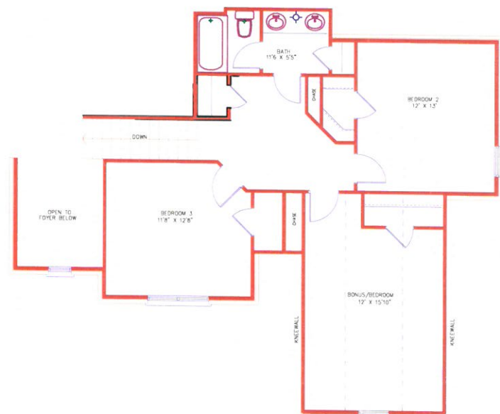
MADISON SECOND FLOOR 821 S.F. HEATED