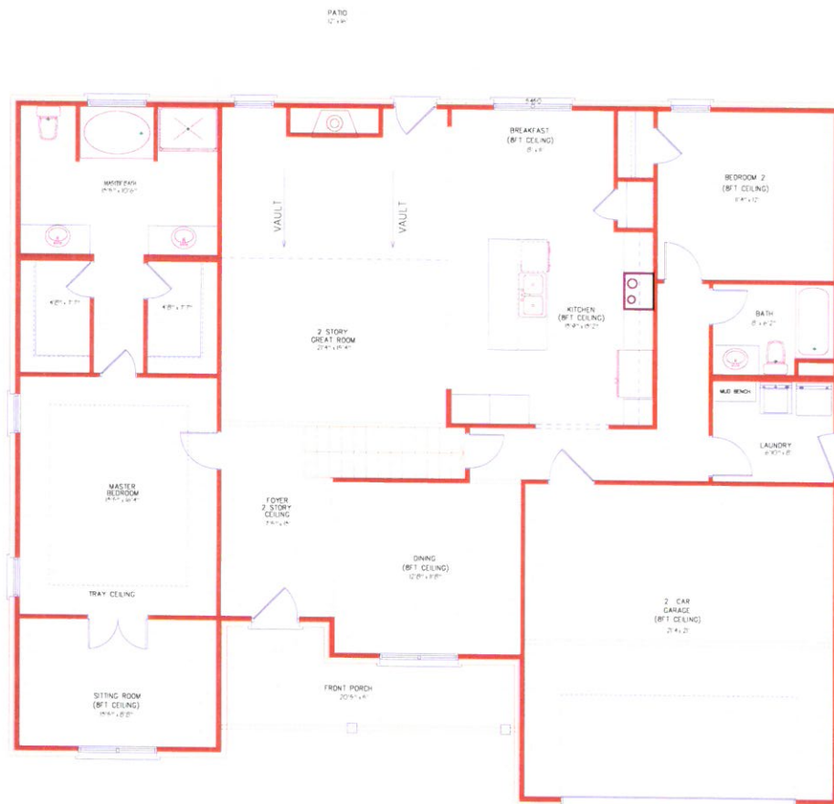
MADISON FIRST FLOOR 2000 S.F. HEATED