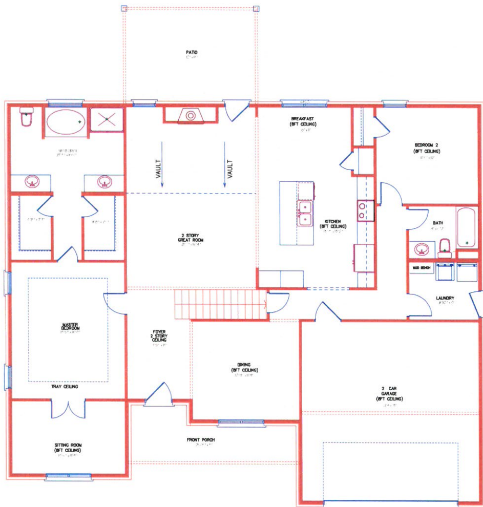
MADISON FIRST FLOOR 2000 S.F. HEATED