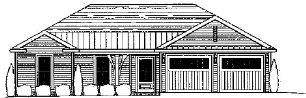
"THE MOULTRIE III" 1327 HEATED SF